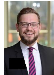
Bennet Gabriel Communications