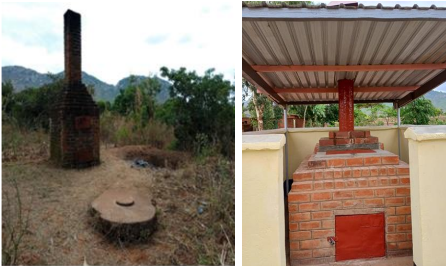
Old incinerator, left, and new incinerator, right.