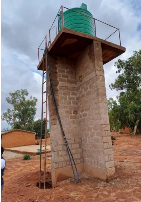
New water tank and stand.

A REPORT FOR PROVIDENCE: MAY 2023–NOVEMBER 2023