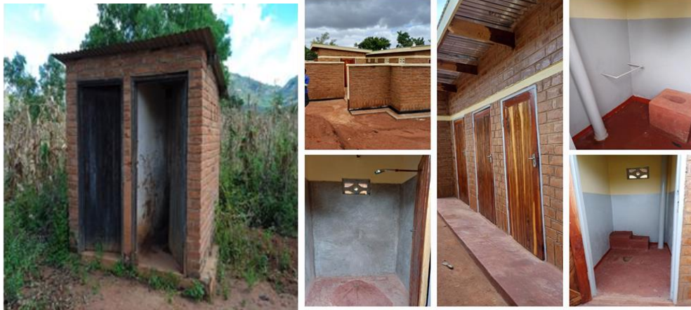
Old pit latrine, left, and newly-constructed pit latrines, right.