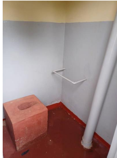
Latrine that was not accessible for people with disabilities, left, and the improved accessible latrine, right.