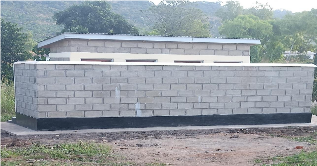
Newly constructed latrines.