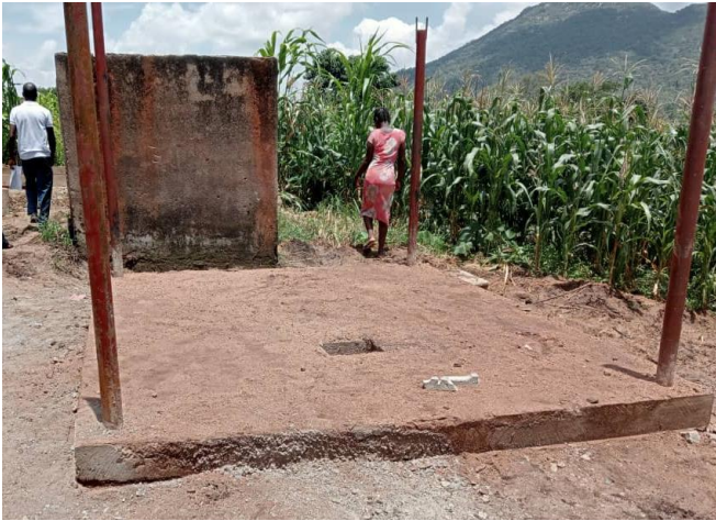
Old and new ash pit.