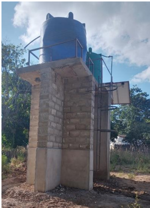
New water tank and stand.