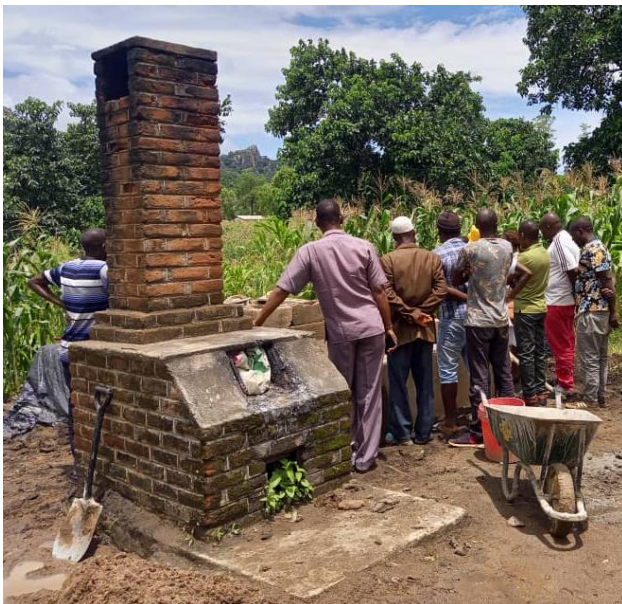
Old and new incinerator