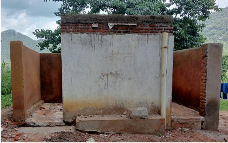
Old and new bathrooms.

Below is a selection of photos demonstrating the impact your gift made possible.