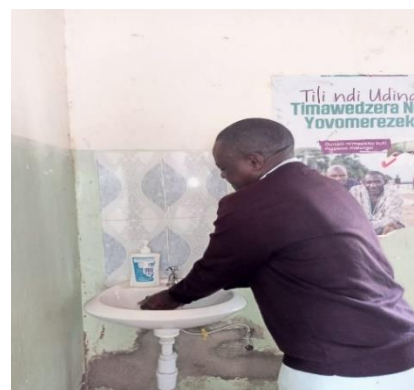
The Sister Martha Health Center now has better water and hygiene infrastructure.