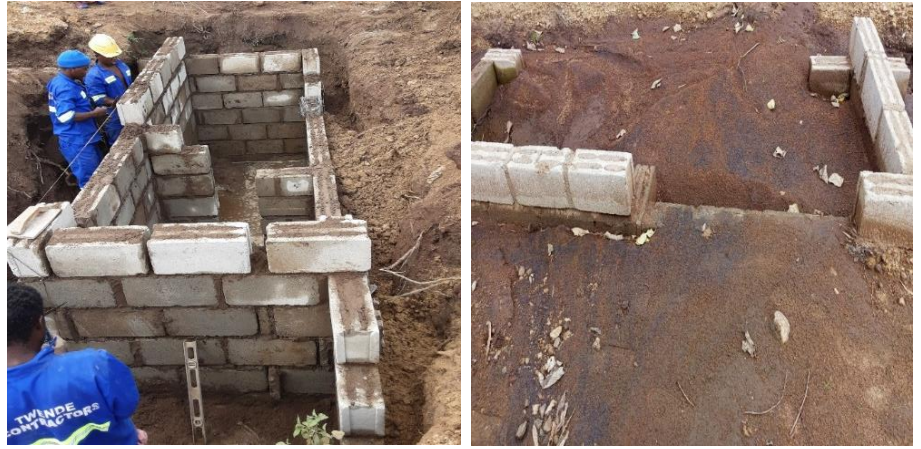
Latrine structure before the cyclone, left, and after, right.

Despite these challenges, the project has demonstrated that water, sanitation and hygiene initiatives are crucial for improving health services in the diocese and for the greater good of communities, so we recommend replicating such projects in other hospitals.